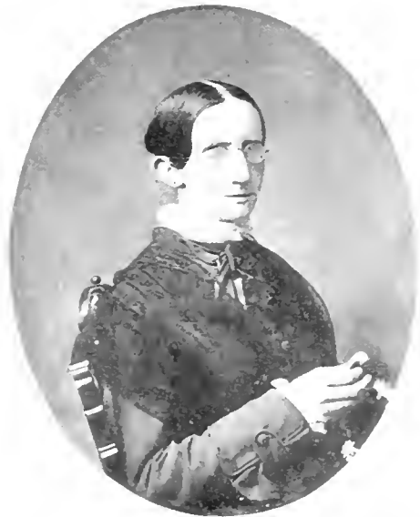
LAURA DEWEY BRIDGMAN.